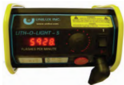
The above LOL-5 model displays a value of 5928 flashes / minute

Our latest redesign of our powerful handheld or fixed mounted LOL-5 includes built-in intensity controls allowing the operator to toggle between two modes by pressing on the Rotary Dial. The two modes, Flash Rate and Intensity, allow complete control of both flash rate (0 to 6000 f/min) and brightness (35 to 100%).