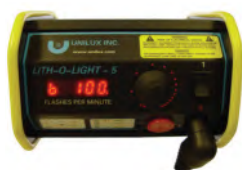
The above LOL-5 model displays a brightness value of 100%