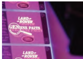
With UV Lens