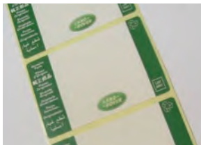
Without UV Lens

Our UV illumination strobe kits allow inspection at full production speed of security print, coatings, sealers and incandescent inks. Using our manual controls or external signals for perfect line speed synchronization, UNILUX has a light to fit any application.